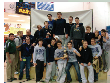
2007 STATE CHAMPS